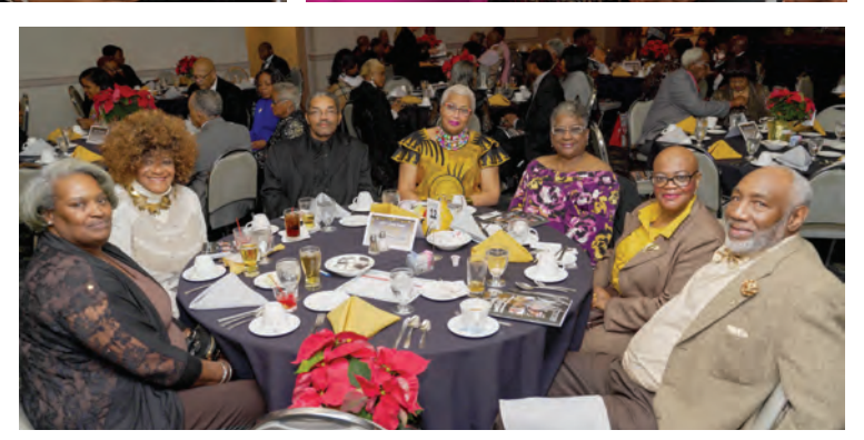
ASC<sup>3</sup> Courier • Winter/Holiday Gala 2018