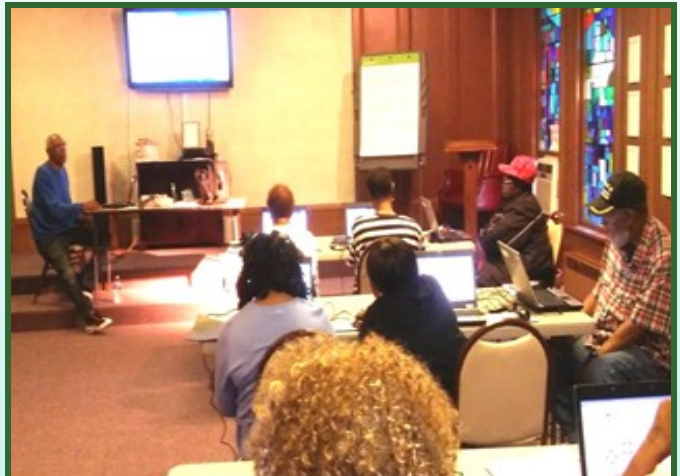
Tuesday/Thursday 9:30am-11:30am class at Helen S Brown/New Cathedral 16200 Euclid Avenue, East Cleveland, Instructor