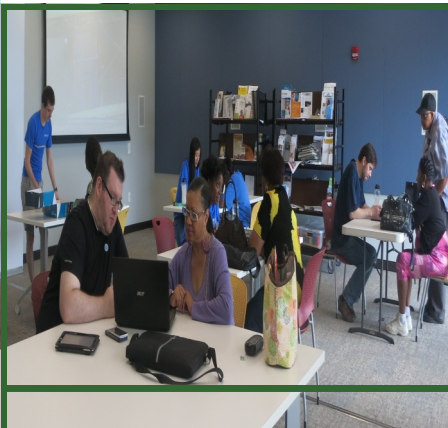
Students were able to receive one on one assistance from volunteers from CWRU, PNC and ASC 3

Case for Community Day volunteers from Case Western Reserve University volunteered at PNC Fair Fax assisting ASC 3 with new tech gadgets for participants seeking help.. More than 50 people attended ASC 3 with lap tops, digital cameras, recorders, iphones, androids, trackers and other kinds of technical devices. Everyone received help and left with technology questions answered and a better understanding of their tech gadgets! Another "Great Day "in the Neighborhood!